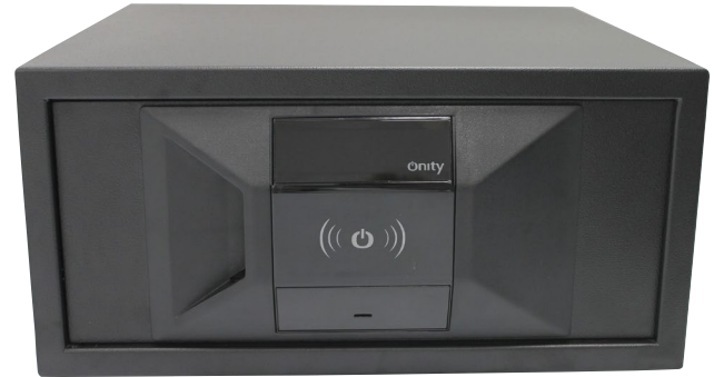
OS700 standard laptop size